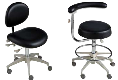
Doctor's and Assistant's Stools