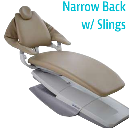
Narrow Back w/ Slings