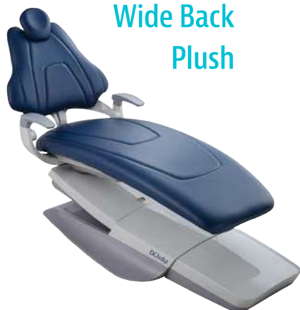
Wide Back Plush