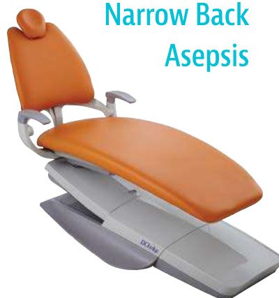
Narrow Back Asepsis